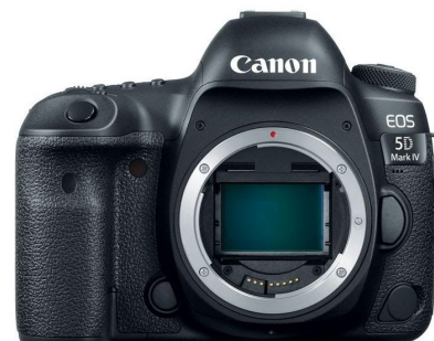
CANON EOS 5D MARK IV