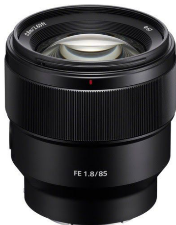
SONY FE 85MM F1.8