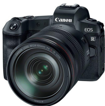
CANON EOS R