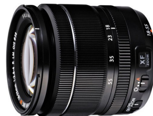
FUJIFILM XF 18 – 55MM F2.8 - 4