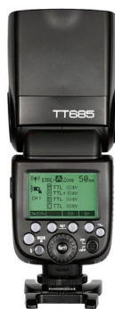
GODOX TT685 MII TTL FLASH