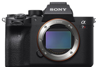
SONY a7R IV