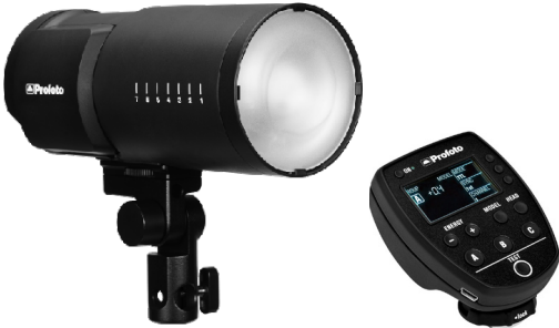
PROFOTO B10 PLUS WITH RADIO TRIGGER