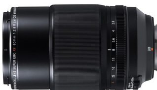
NICE TO HAVE (FUJIFILM XF 80MM F2.8 MACRO)