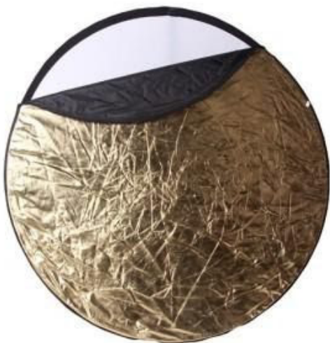
5-IN-ONE REFLECTOR (107CM/ 109CM/ 110CM)