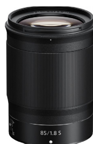
Nikon Z 85mm F1.8 S