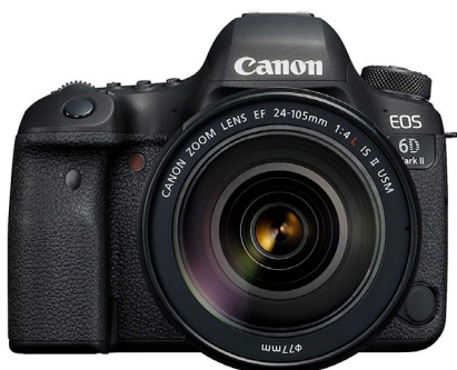
CANON EOS 6D MARK II