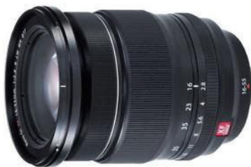
FUJIFILM XF 16 – 55MM F2.8