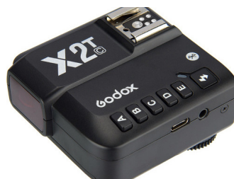
GODOX X2T TTL WIRELESS FLASH TRIGGER TRANSMITTER