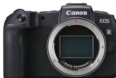
CANON EOS RP