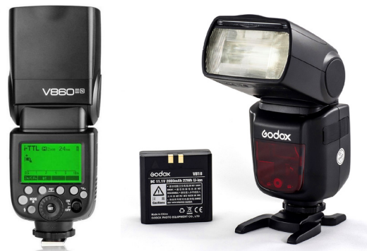
GODOX V860III TTL LI-ION FLASH KIT