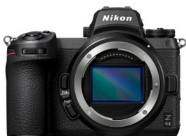
NIKON Z6 II