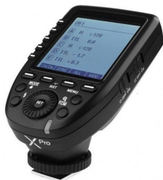
GODOX XPRO TTL WIRELESS FLASH TRIGGER