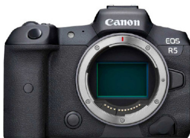
CANON EOS R5