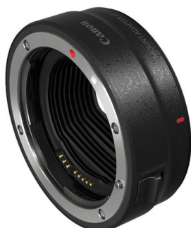
CANON MOUNT RF-EF ADAPTER EF-EOS R