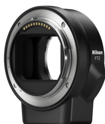
NIKON FTZ ADAPTER