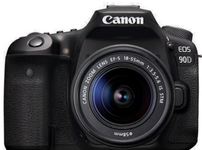
CANON EOS 90D