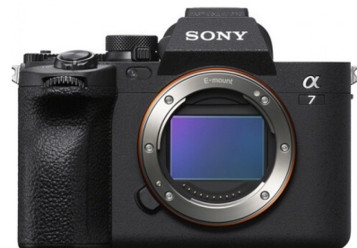
SONY a7 IV